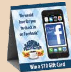
Table tents are used for more than restaurant upsells. They are a powerful tool to sell when you are not able to be there, attract repeat business, promote new products or services, and dress up special events.