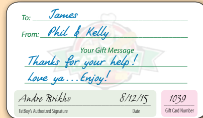
Gift Cards 2"x3½" Design Fee - $39 • Print 250 - $39