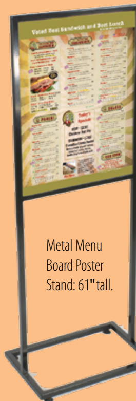
Metal Menu Board Poster Stand: 61" tall.

Design Fee 22"x28" - $99 Print & Laminate Poster - $79 Print & Dry Erase Laminate Poster - $89