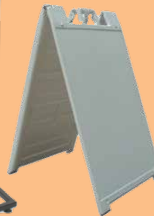
Rugged plastic collapsible sign holder: 24" wide; 36" tall.