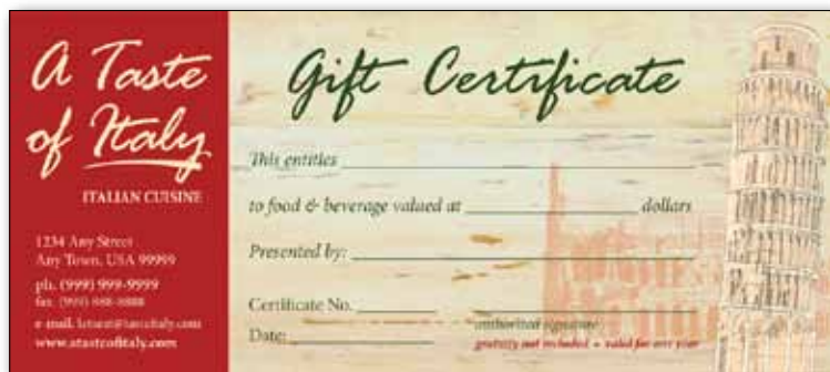
GIFT CERTIFICATE - FRONT

Gift Certificates are printed on card stock. We print on both front and backside. Gift Certificates can be designed as a "fill in" dollar amount or we can print with a "fixed" dollar amount. We also design "special event" GC like for Mother's Day.